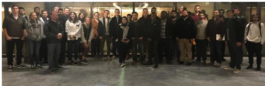
RDEV 660 & 450 Students