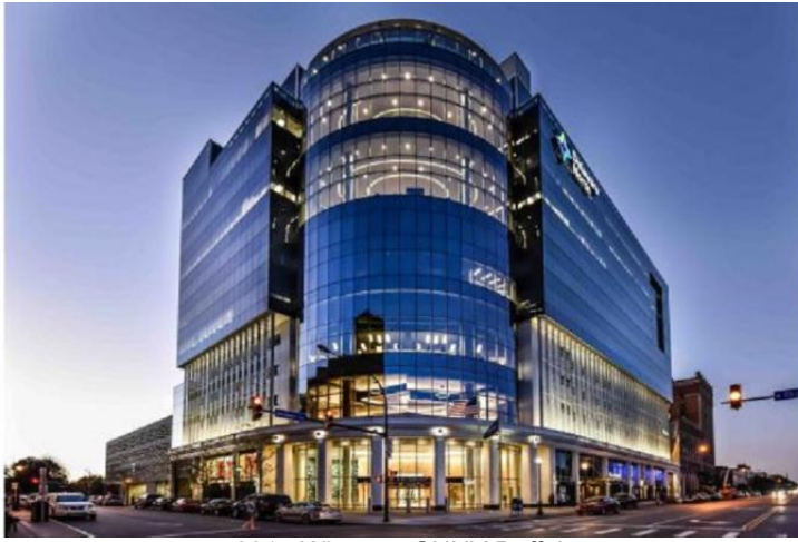
2017 Winners: SUNY Buffalo

The Third Annual Colvin Case Study Challenge will be held on Saturday, December 8th from 1:00 pm - 5:00 pm in Room 1111 of the Architecture Building at the University of Maryland, College Park . Four finalists teams from across the nation will be presenting this day to a panel of industry professionals. A reception will follow at The Hotel at The University of Maryland from 5:15 pm- 7:15 pm.