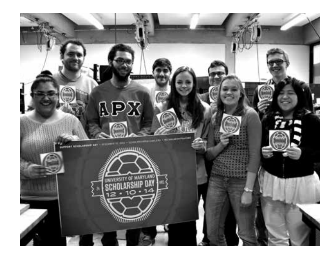
Left: Students celebrating the university's first Scholarship Day, where the school raised the largest amount of scholarship dollars of colleges and schools campuswide on the "Day of Giving."