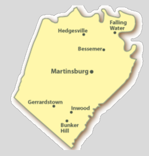
Source: Weichert Realtors, Berkeley County, West Virginia Real Estate, <a href="http://www.weichert.com/WV/Berkeley/">http://www.weichert.com/WV/Berkeley/</a>

Berkeley County is located in the Eastern Panhandle of the state and has a total population of 110,497, with 40,447 households (2009-2013) and a median household income of $53,515 (2009-2013).<sup>2</sup> It is the second most populous county in West Virginia. The County covers approximately 321<sup>3</sup> square miles of land, and within the County lies the City of Martinsburg, which spans 6.65 square miles.4 Berkeley County is part of the small portion of West Virginia that falls within the Chesapeake Bay watershed. The County is bordered by Morgan County on the northwest, Jefferson County on the southeast, and Frederick County, Virginia on the southwest, and the Potomac River on the northeast, which separates West Virginia from Washington County, Maryland.5 For the purposes of this study, the area described is the entire County of Berkeley, excluding the City of Martinsburg, since the City is under its own MS4 permit to manage stormwater within City limits.