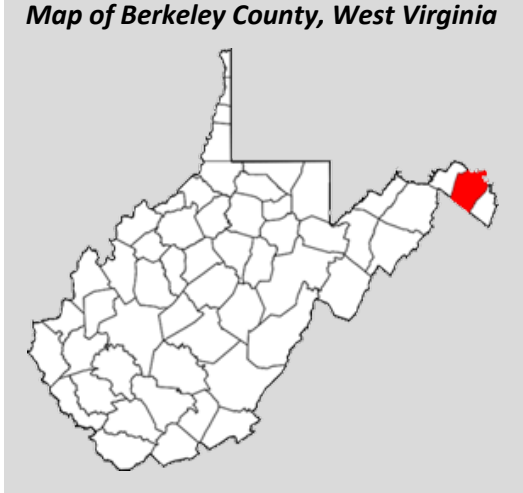
Source: U.S. Genealogy Express, Welcome to State of West Virginia, Berkeley County, <a href="http://www.usgenealogyexpress.com/~wv/">http://www.usgenealogyexpress.com/~wv/</a> berkeley/