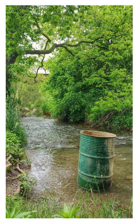
Tuscarora Creek at Oatesdale Park, City of Martinsburg, Berkeley County, West Virginia

share responsibilities, and that the PSSD was not currently in compliance with activities under MCMs 3-6.8 Although the U.S. EPA as part of the inspection process did not assess MCMs 1 and 2, the EFC Project Team still considers them to be critical to the success of any stormwater program. These measures that focus on outreach and engagement help to educate and inform the community about the importance of