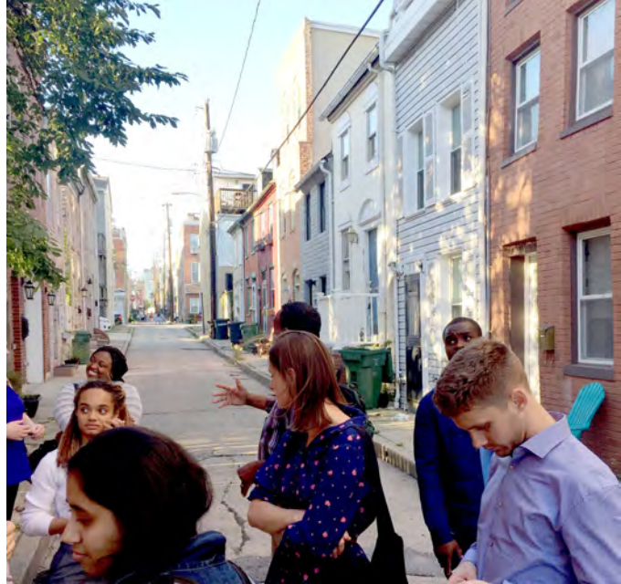
Figure 12. Graduate students at the University of Maryland studying historic preservation.

There are multiple educational paths towards a career centered on administering a historic site, house museum, or history museum. It is very common to find people successfully working in this sector with a museum studies or history major as well as historic preservation—these are also the majors that employers are seeking. The advantage that an historic preservation major would give you in this area is an understanding of historic buildings that would be advantageous in the interpretation of the building itself, including using archival research methods to understand a building's history; museum studies and history majors, for instance, often lack coursework on understanding the materials and methods from which older buildings are constructed or the history of interior decorative treatments and furnishings. On the other hand, many historic preservation majors don't, by default, offer coursework in collections management, which is essential for working in this sector. My suggestion would be to locate a school where you would be able to combine coursework in historic preservation and museum studies that could cover all of these areas, which could be accomplished through electives, minors, certificates, or a dual major/degree.