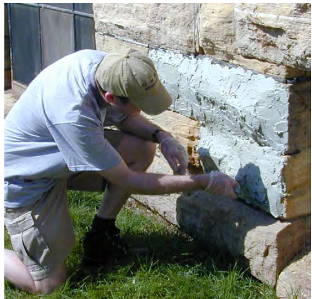
Figure 5. The application of a desalination poultice to a building is a technique used in architectural materials conservation.

Work in an architecture firm, where you might be called a “preservation architect” (if