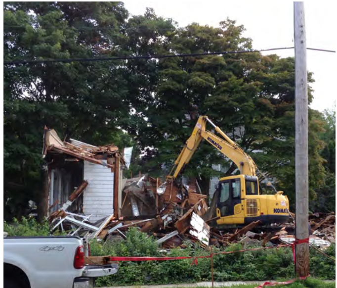
Figure 7. Regulations are but one tool to avoid the outcome of demolition.

Based on the earlier discussion, it should not be surprising that this list is dominated by laws and regulations. What might be unexpected to the uninitiated, however, is that employers of people who work in the historic preservation field and engage in regulatory compliance—mostly within cultural resource management firms, not local municipalities—also want familiarity with environmental protection laws. This might be explained though the way in which, at the federal level, historic preservation and environmental protection laws are often conflated into “environmental review” and such work happens in parallel and within the same firm.