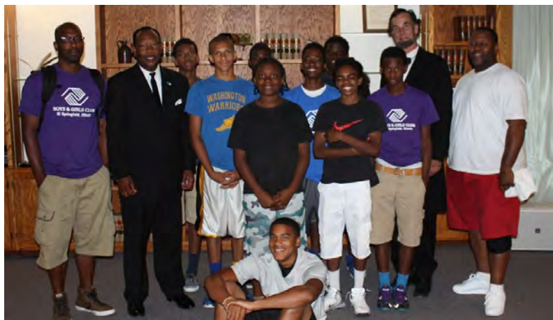
Figure 11. Members of the Boys and Girls Club of Central Illinois at the Civil Rights Act of 1964 anniversary program at the Old State Capitol State Historic Site.