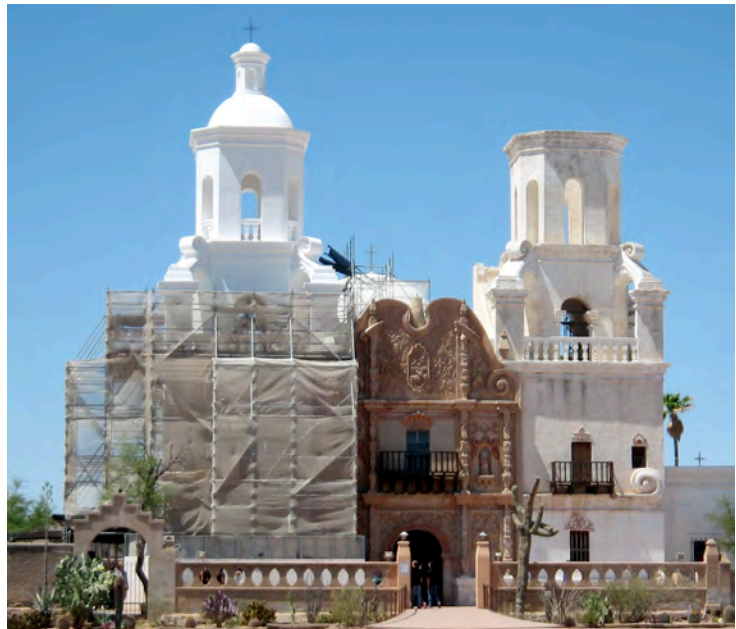
Figure 1. Mission San Xavier del Bac in Arizona, built between 1783-1797, undergoing conservation work. While high style buildings from many cultural groups have always been a focus of preservation practice, today there is an increased interest in the everyday built heritage of non-dominant cultural groups whose heritage has been substantially underrepresented.