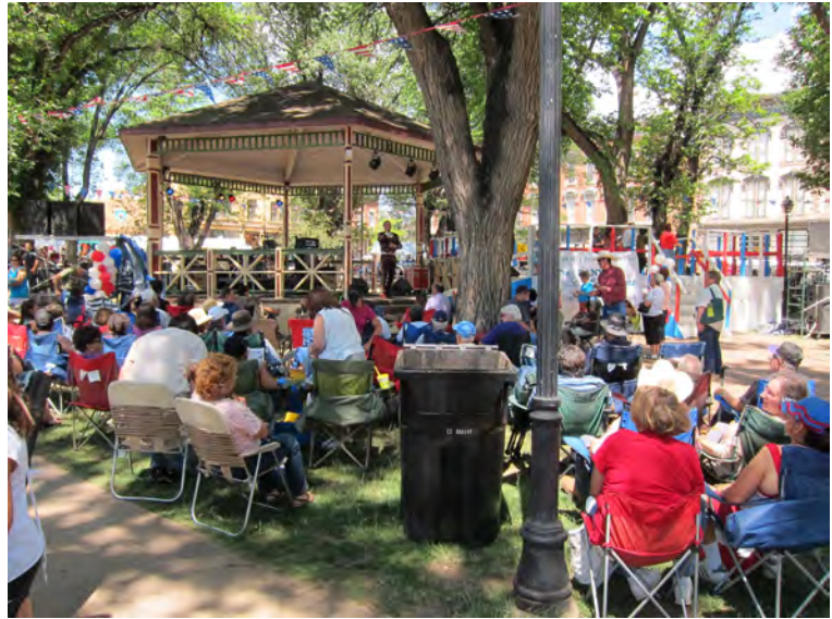
Figure 6. The Main Street Program in Las Vegas, New Mexico regularly hosts events in their downtown, such as this one in the main square that features local cultural traditions such as music and dance.

The last major area of practice has much in common with preservation advocacy, but focuses this advocacy on the revitalization of distressed urban areas that are characterized by the many historic buildings and places. The National Main Street Center, which is a subsidiary of the National Trust for Historic Preservation, is perhaps the best example of work in this area. Jobs in this sector are also associated mostly with non-profit organizations along with a few government agencies. Staff sizes are typically quite small with the only paid staff person being an executive director or a “Main Street manager.” People who enjoy working in this area are often deeply