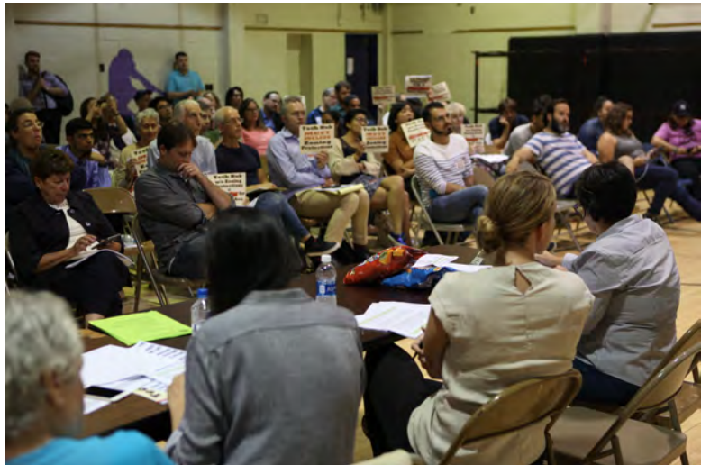
Figure 4. Greenwich Village Society for Historic Preservation public meeting on Saving Third & Fourth Avenue Corridors in New York. Working with the public is frequently required in most aspects of practice.