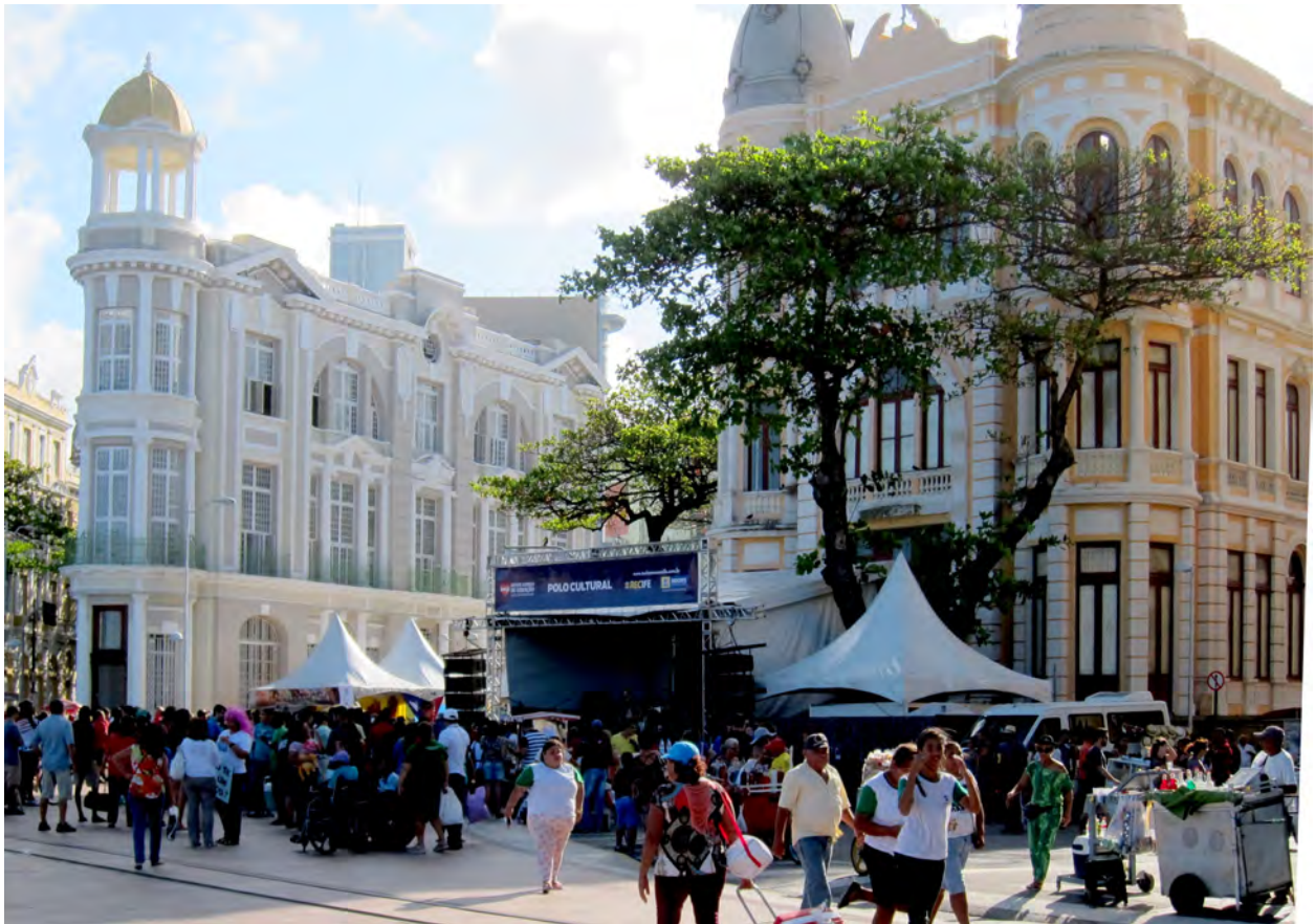
Figure 13. Historical center of Recife, Brazil. Historic preservation is an international activity, with international options. Names used internationally include heritage conservation, conservación del patrimonio (Spanish), and 遺產保護 (Chinese), among many other possibilities.

The last thought I will leave you with is to impress how important it is for new people, who have not traditionally considered this career path, to enter the field. We are challenged on multiple fronts by static regulations, climate change, and a serious need to address issues of inclusion, diversity, and social justice. To address these challenges, we need new perspectives, ideas, and methods that can more fully recognize, celebrate, and capitalize on the multiple heritages that represent our amazingly diverse country. Most people won't get rich working as an historic preservationist, but where else can you work in a field that fundamentally impacts people's identity, wellbeing, and sense of place.