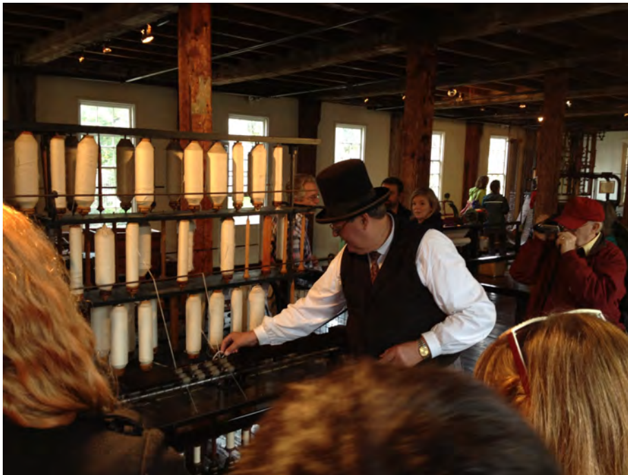
Figure 8. Living history interpretation of a textile mill at Slater Mill, Pawtucket, Rhode Island.

Noteworthy in the category of historic sites and museums is the absence of required knowledge of historic preservation laws and regulations and an emphasis on interpretation/exhibit design, collections management, and working with budgets and raising funds. These types of organizations are often small non-profits or state museums which rely extensively on grants to operate.