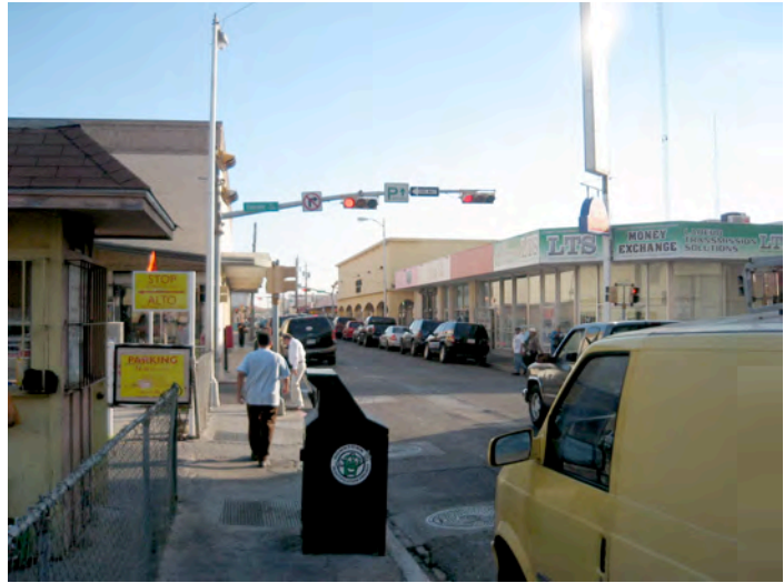
Figure 9. Downtown Laredo, Texas. The future of preservation lies in understanding everyday people's relationship with everyday places.

Climate change. It used to be that one of the largest threats to the survival of historic buildings, places, and landscapes was demolition or neglect; now we can add climate change to this list. As sea levels continue to rise, some of the most cherished historic places will increasingly be threatened in our older coastal communities, such as Annapolis, Charleston, New Orleans, and New York. Even with massive interventions, we cannot save all of these historic buildings and places, which means the future is fraught with some very difficult decisions. By necessity, this area will increasingly be one of the most