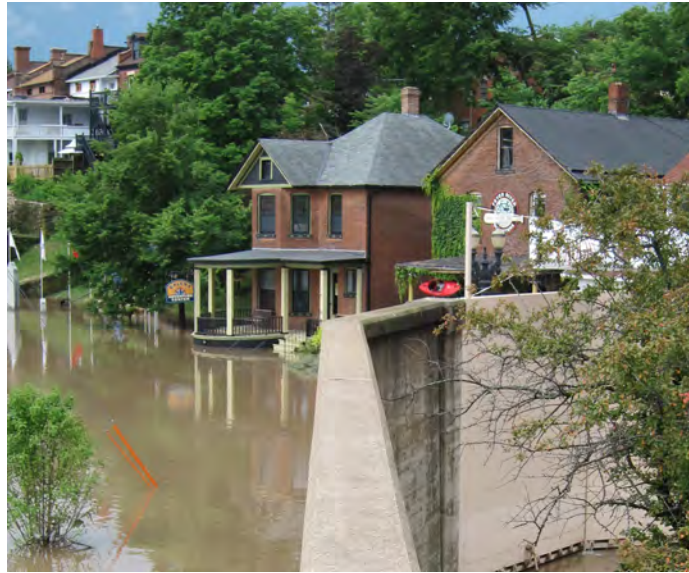
Figure 10. Flooding is a serious and increasing threat to historic buildings with few ready solutions.

Gathering human-centered evidence and creating a dynamic feedback mechanism for revising policy. If we fully accept the premise that historic preservation is meant to benefit everyone, including laypeople, then we need to answer fundamental questions about how older places benefit and do not benefit people from a range of economic, social, cultural, and psychological perspectives. Policy should then be built on this foundation of