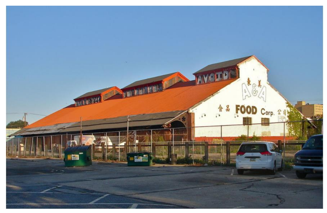
The PW&B trainshed right before constructed started on its rehabilitation.

addition, there is a pedestrian walkway, the Lincoln Walk, that allows for community gatherings and community-oriented events.