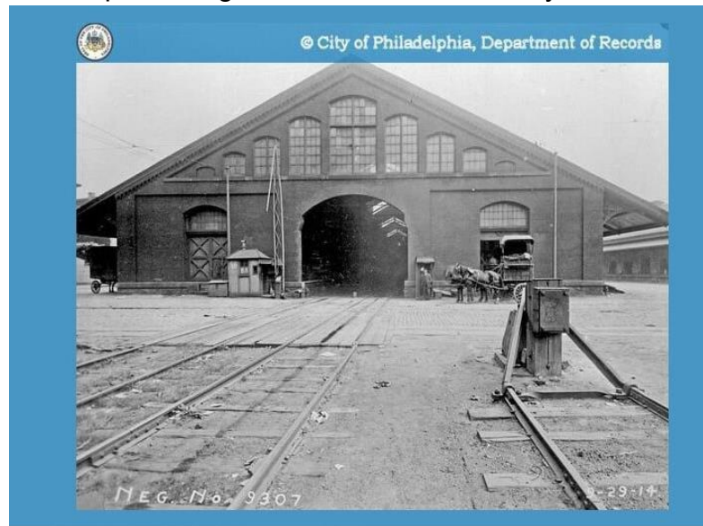
The original Philadelphia, Wilmington & Baltimore Railroad Freight Shed.

MIS Capital's original vision of this site may not be the vision anyone would have