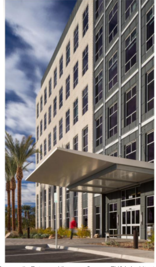
Two Summerlin Entrance View

VCC created and executed a great air quality management strategy. Construction was sequenced in such a