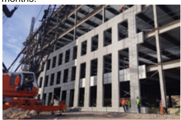
Two Summerlin Precast Panels

EV&A was able to provide a tilt-up building that is considered Class A. Based on the past development of One Summerlin, which is attached to retail in the Downtown Summerlin Complex, a glass curtain wall was costly, and Howard Hughes wanted a way around spending the extra money. They were able to use a precast concrete exterior screen, glass, and steel that was cost effective. EV&A created a Class A office building that worked well with the Desert environment. The precast panels help with reducing cooling costs and increasing tenant comfort in the summer months.