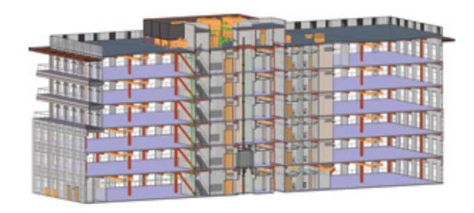
Two Summerlin EV&A

Two Summerlin has a total of 6 floors of office space; each floor has about 24,500 square feet of rentable area. The building has been separated as 15 units to fulfill tenants' needs. Most of the first floor is used as the new local headquarters of Howard Hughes Corporation, while Avison Young occupied the rest area on the first floor. The second and third floors are leased to WeWork corporation. The fourth floor is leased to GT and other tenants, the fifth floor is leased to CLA and other small tenants, and the sixth floor is leased to RSM US and other small tenants.