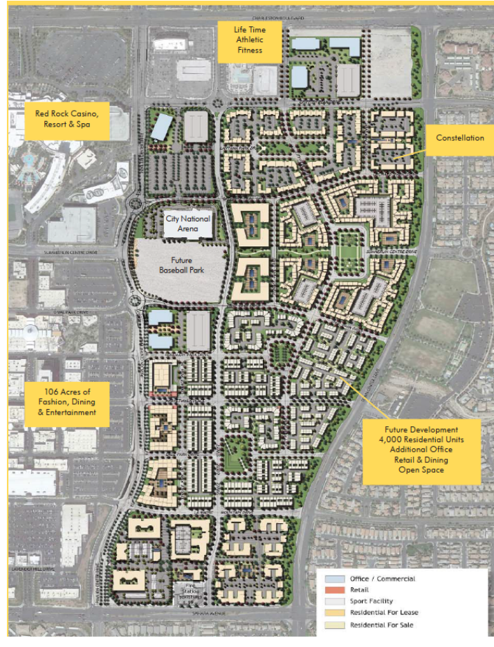
Summerlin Future Development Map Source

The concept of Master Plan Community suggests people can live, work, and entertain within the CBD. In Summerlin, there are a lot of single-family homes and apartments for living. Downtown Summerlin has multiple entertaining