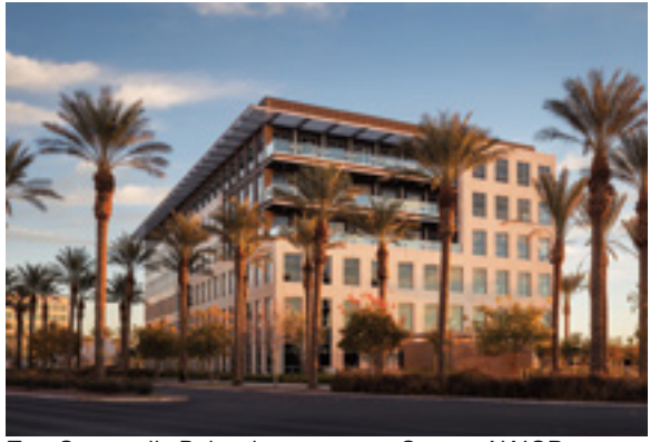
Two Summerlin Balconies

on both the Red Rock Canyon and the Las Vegas Strip Views.