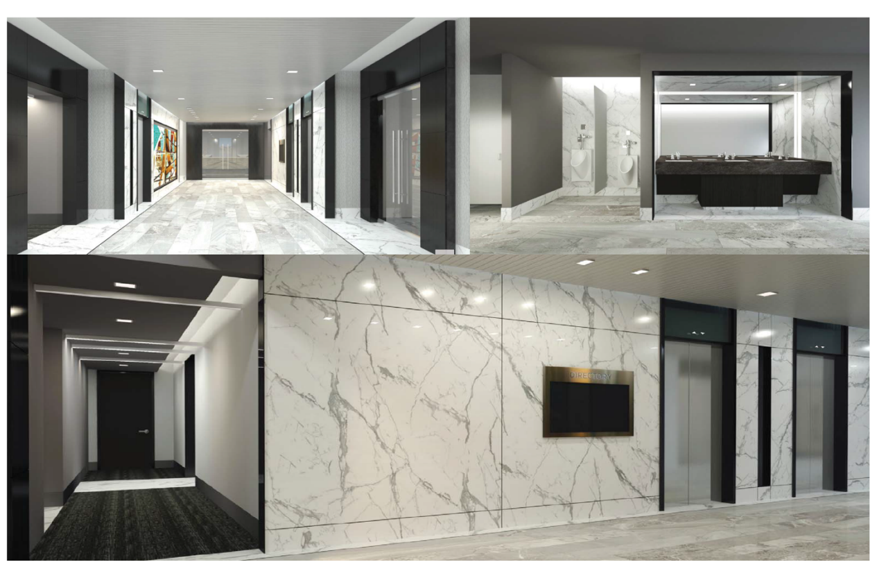
Two Summerlin Interior

The aggressive timeline was necessary because Howard Hughes Corporation's lease was ending. HHC was paying high rent and wanted to vacate as soon as possible. Another issue was moving in while moving out of the previously leased space. The coordination was an issue and the tenant improvements took five months instead of three.