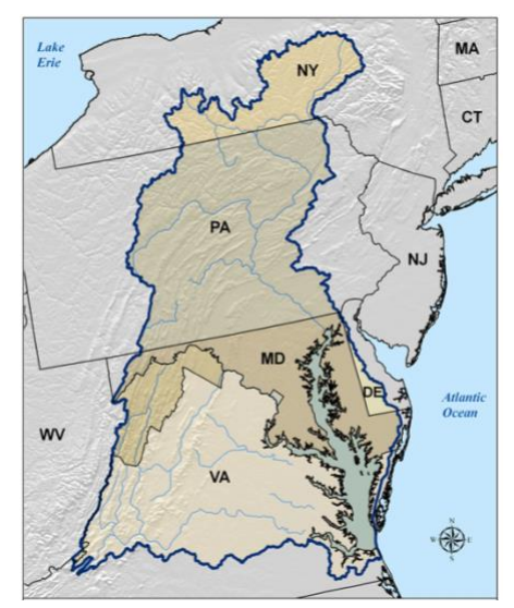
Figure 1. New York's location within the Chesapeake Bay watershed.

To restore the health of the Chesapeake Bay and to preserve water quality in New York's local streams and rivers, the state has joined the five other Bay states and the District of Columbia in adopting rigorous pollution reduction targets. These goals are spelled out in the US EPA's Chesapeake Bay 2010 TMDL, which specifies levels of nutrient and sediment pollution reductions that must be achieved in each Bay jurisdiction by 2025 in order to meet water quality standards for dissolved oxygen, water clarity, underwater Bay grasses, and chlorophyll a.<sup>6</sup> Table 1 shows TMDL final targets for New York and for the watershed as a whole.