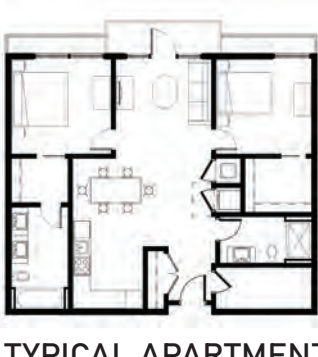
TYPICAL APARTMENT UNIT LAYOUT