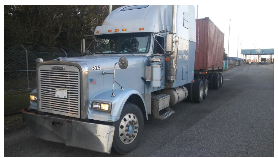
Truck outside the port with gate in background