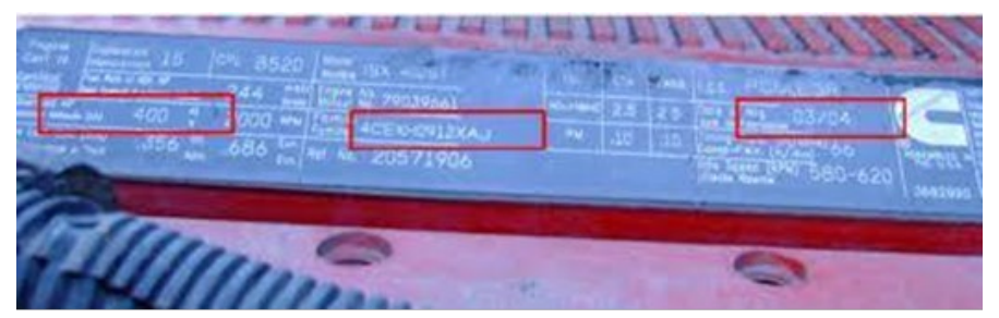
Cummins Engine Example