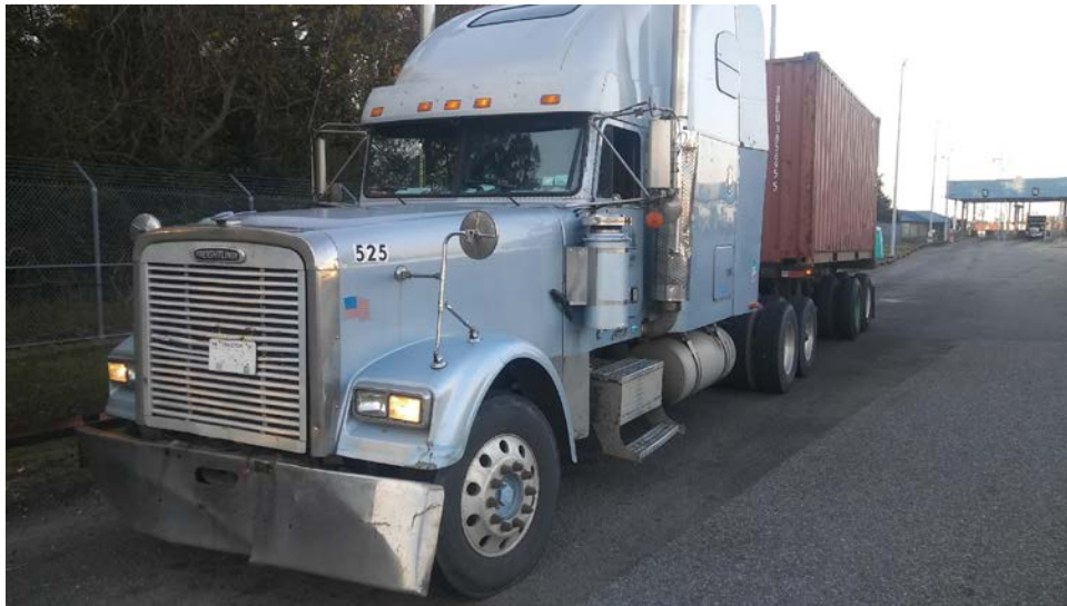
Truck outside the port with gate in background