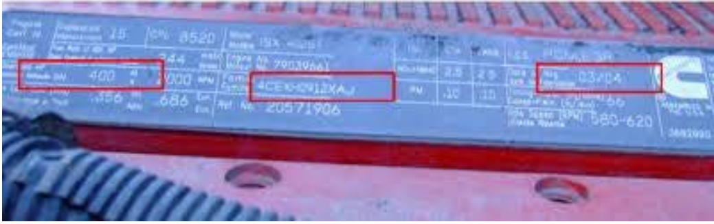
Cummins Engine Example