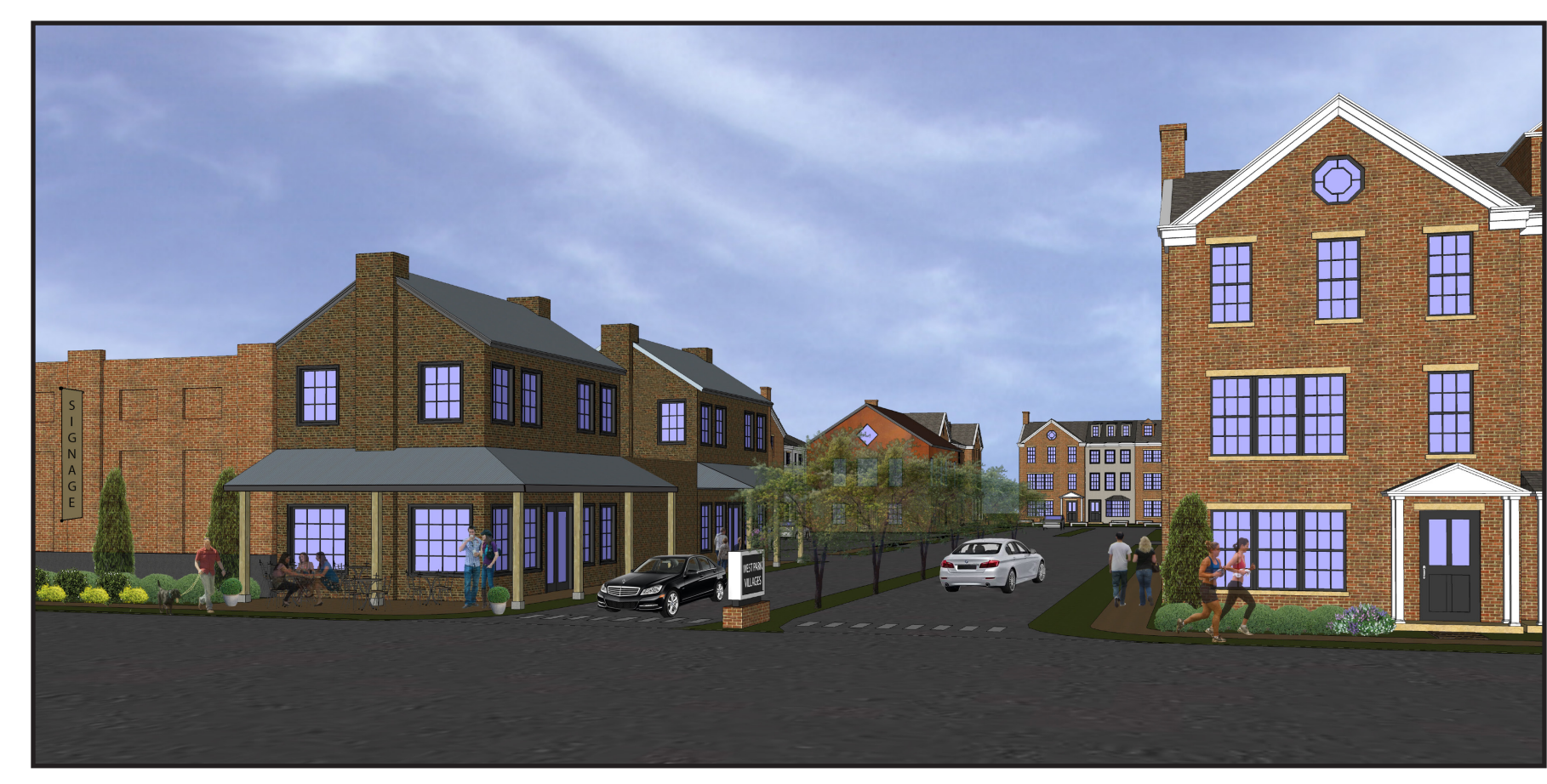
B. STREET VIEW OF WEST PARK VILLAGE ENTRANCE