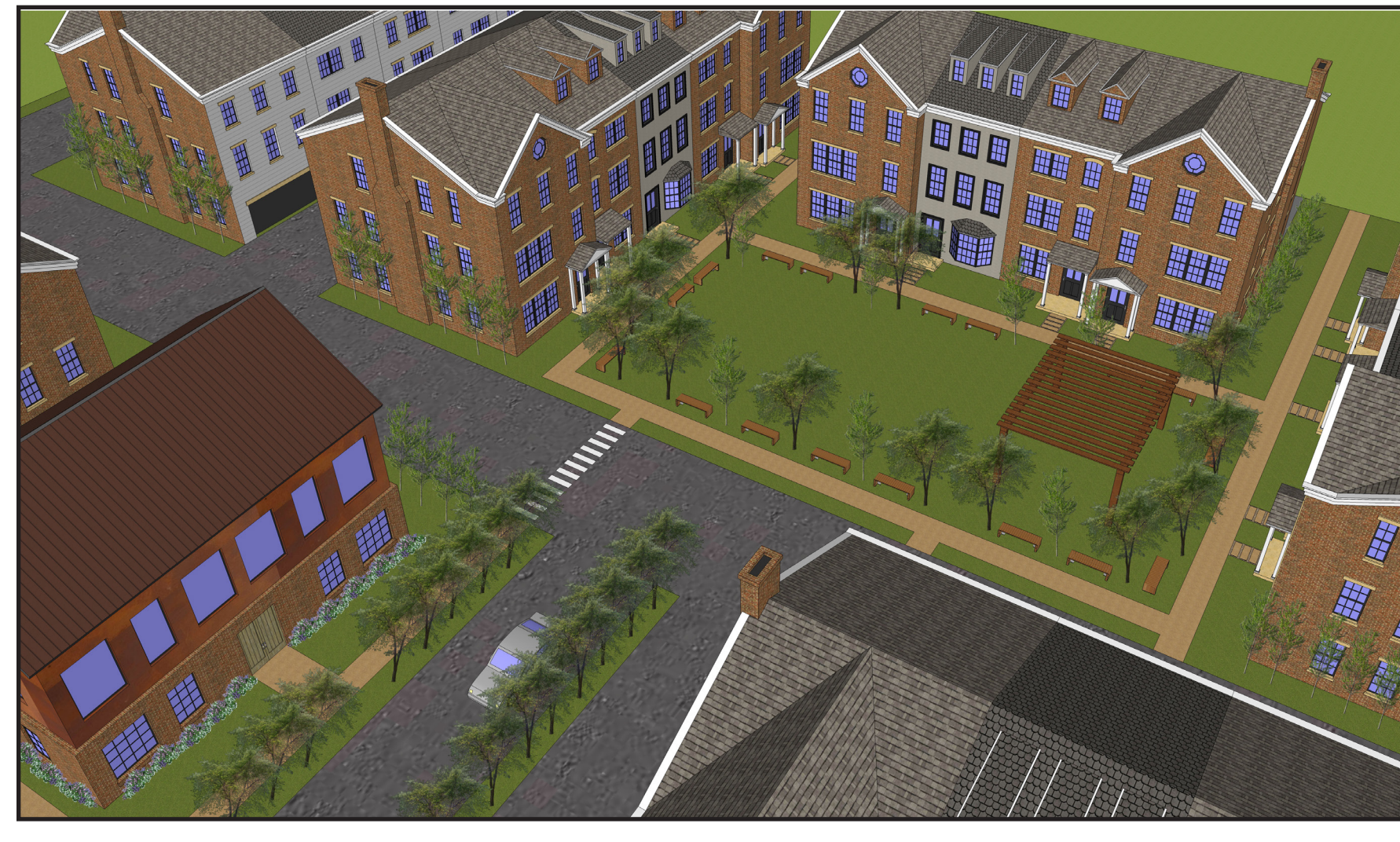
A. AERIAL VIEW OF COMMUNITY AMENITY AREA