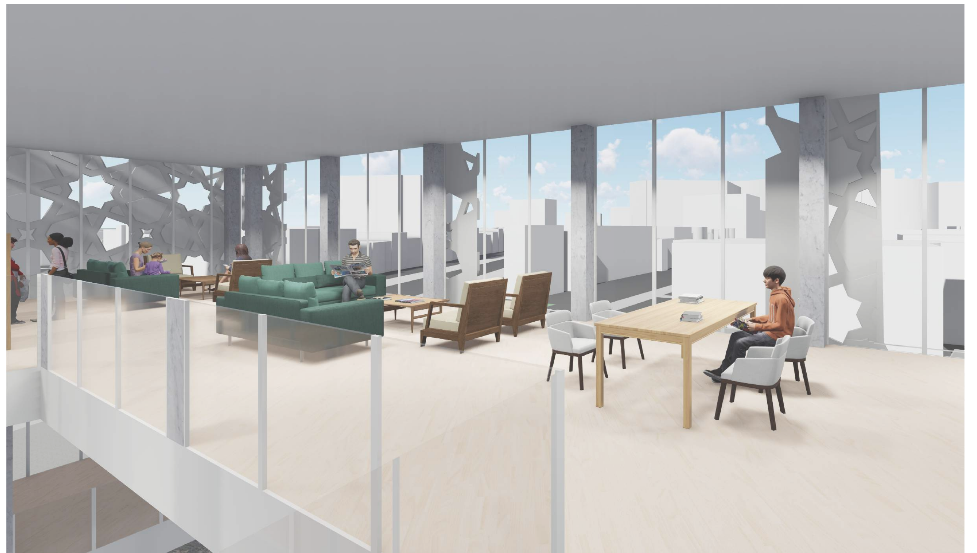
THIRD FLOOR PERSPECTIVE