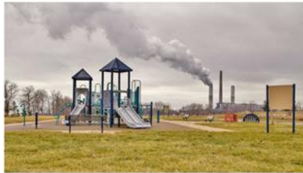
Environmental Justice Thriving Communities Technical Assistance Center Programs