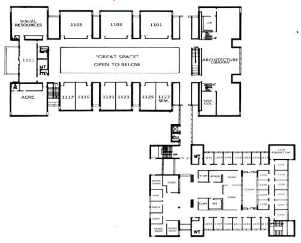
Appendix A - Architecture Building Plans