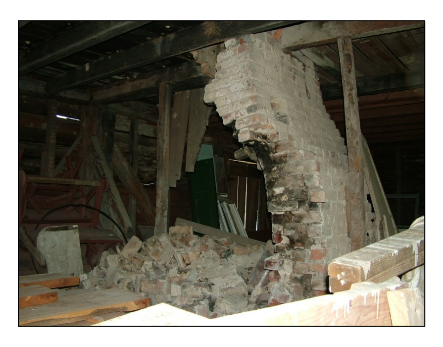
Figure 4. The central fireplace mass and chimney in the Four Square quarter has almost completely fallen, and the entire structure is in imminent danger of collapse.

Another message calls for preservation beyond the traditional safeguarding of the physical record of slavery. We also must encourage the greater public interpretation of slave housing, of enslaved African Americans, and of slavery—especially in contrast to the pattern of preserved or restored slave houses within pristine landscapes obscuring the former harsh reality of slave life and slave ownership. While accommodating the various needs of current owners, we should actively interpret and, if possible, restore more accurate landscapes of slave housing and slave life. Descendants of enslaved African Americans have different questions and challenging views of such places and buildings, perspectives that remind us of the issues of social and scholarly responsibility surrounding our research. Slave housing represents a shared, but still problematic American heritage with a palpable public and political context.