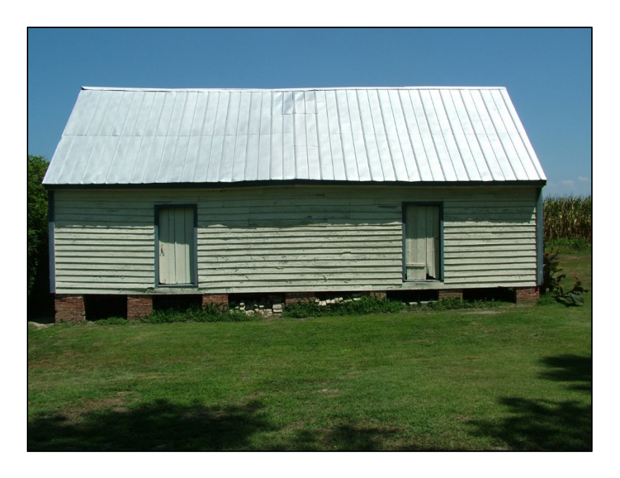
Figure 3. The frame quarter at Four Square plantation, in Isle of Wight County, was erected in two phases, dendro-dated to 1789 (right) and 1830 (left).

dated 1789 and 1830), to the database is an unexpected coup, bolstering the information provided by Prestwould (I 1790, II 1840), the only other dated eighteenth-century slave building in Virginia. As such, the span of time covered by the sample is roughly seventy years, with ten of the eleven datable phases falling within the period from 1813 to 1858. As this is precisely the time period that we identified as particularly difficult for establishing construction dates based on building fabric alone, this represents a major advance in knowledge. On the other hand, the sample remains relatively small, and any analysis based on these results must be viewed as tentative at best. Finally, the preliminary findings clearly indicate the value of dendrochronological testing for better understanding temporal variation in construction practices, building technologies, and hardware.