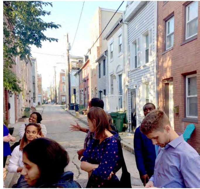
Figure 12. Graduate students at the University of Maryland studying historic preservation.

architecture as the required entry-level degree to practice. What you will find, however, is that most architecture programs will not be able to provide coursework in the areas of traditional construction materials and methods, building condition assessments, architectural materials conservation, or the application of preservation standards in rehabilitation projects. Realistically, you will need to have this educational background to competitively work in this particular sector. Some possibilities to ameliorate this situation include obtaining an undergraduate degree in historic preservation prior to entering a master of architecture program; or finding a school that has both architecture and historic preservation coursework, and while earning the master's degree in architecture, 1) take additional