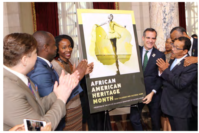
Figure 2. Historic preservation is about more than just buildings. Its practitioners also focus on the full richness of cultural diversity in all kinds of settings in the built environment and cultural landscapes.

There are two things I need to explain before I begin. First, the phrase, "historic preservation", is more closely associated with rules, laws, and regulations and a political movement than with a specific career path. This observation might seem odd, but while there are plenty of historic preservation laws, there are no job titles with the phrase "historic preservationist" in them. Calling oneself an "historic preservationist" can describe an advocation as well as a sense of mind, a calling, and an ethical prerogative, but it won't be in your job title. It's therefore important to be clear that the way in which I use "historic preservation"