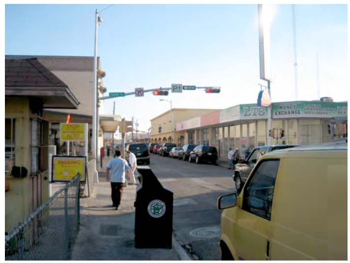
Figure 9. Downtown Laredo, Texas. The future of preservation lies in understanding everyday people's relationship with everyday places.

Diversity, inclusion, social justice and equity. Historic preservation traditionally has focused on the monumental buildings and places associated with wealthy, white men. Today, we need