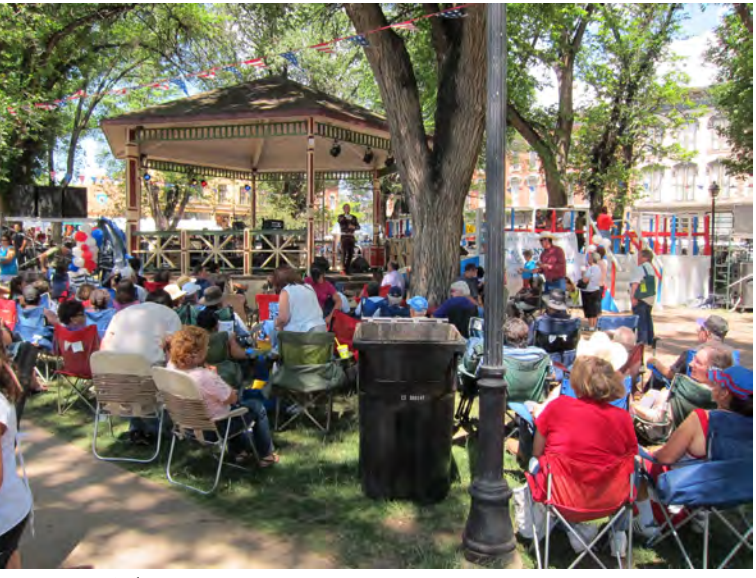
Figure 6. The Main Street Program in Las Vegas, New Mexico regularly hosts events in their downtown, such as this one in the main square that features local cultural traditions such as music and dance.

The last major area of practice has much in common with preservation advocacy, but focuses this advocacy on the revitalization of distressed urban areas that are characterized by the many historic buildings and places. The National Main Street Center, which is a subsidiary of the National Trust for Historic Preservation, is perhaps the best example of work in this area. Jobs in this sector are also associated mostly with non-profit organizations along with a few government agencies. Staff sizes are typically quite small with the only paid staff person being an executive director or a "Main Street manager." People who enjoy working in this area are often deeply