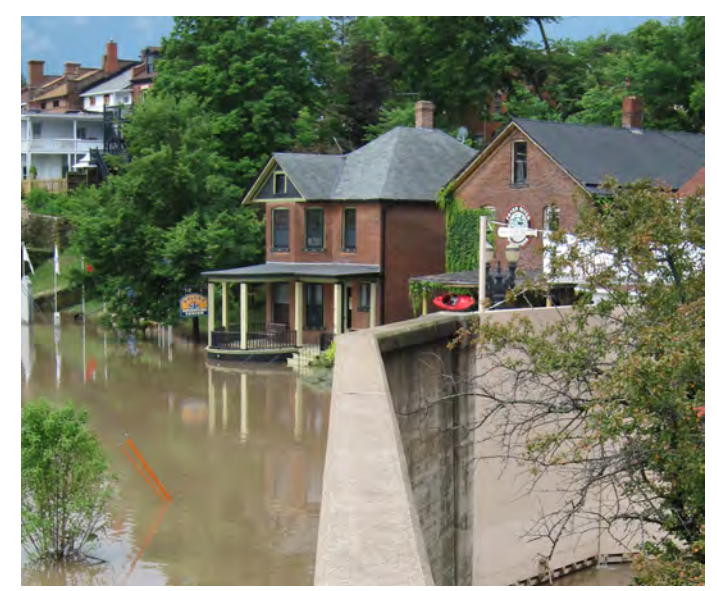
Figure 10. Flooding is a serious and increasing threat to historic buildings with few ready solutions.

Accessing, respecting, and using local knowledge. Few would argue against the basic contention that historic preservation should benefit all people regardless of their expertise—a goal often