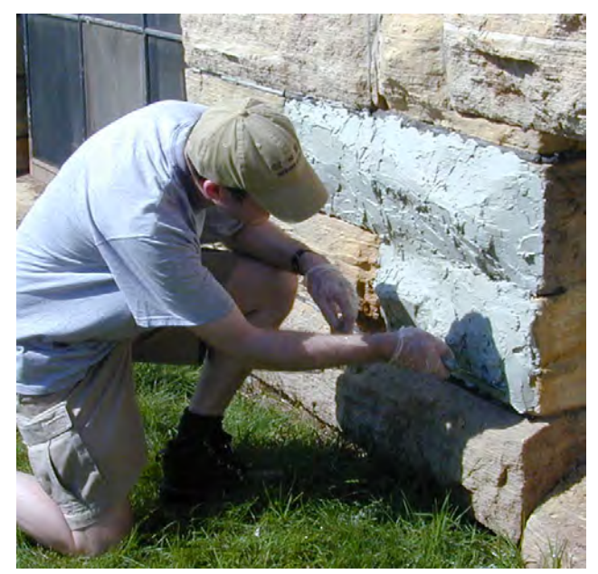
Figure 5. The application of a desalination poultice to a building is a technique used in architectural materials conservation.

Work in an architecture firm, where you might be called a "preservation architect" (if