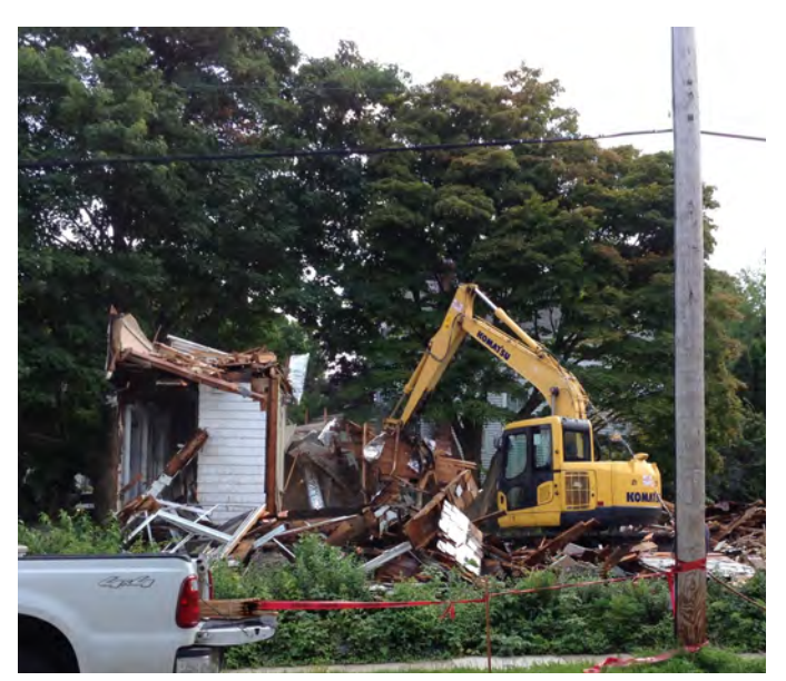
Figure 7. Regulations are but one tool to avoid the outcome of demolition.

Based on the earlier discussion, it should not be surprising that this list is dominated by laws and regulations. What might be unexpected to the uninitiated, however, is that employers of people who work in the historic preservation field and engage in regulatory compliance-mostly within cultural resource management firms, not local municipalities-also want familiarity with environmental protection laws. This might be explained though the way in which, at the federal level, historic preservation and environmental protection laws are often conflated into "environmental review" and such work happens in parallel and within the same firm.