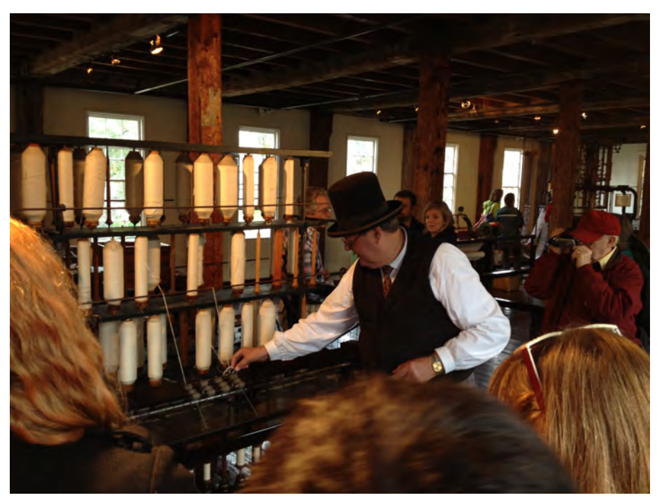
Figure 8. Living history interpretation of a textile mill at Slater Mill, Pawtucket, Rhode Island.

Noteworthy in the category of historic sites and museums is the absence of required knowledge of historic preservation laws and regulations and an emphasis on interpretation/exhibit design, collections management, and working with budgets and raising funds. These types of organizations are often small non-profits or state museums which rely extensively on grants to operate.