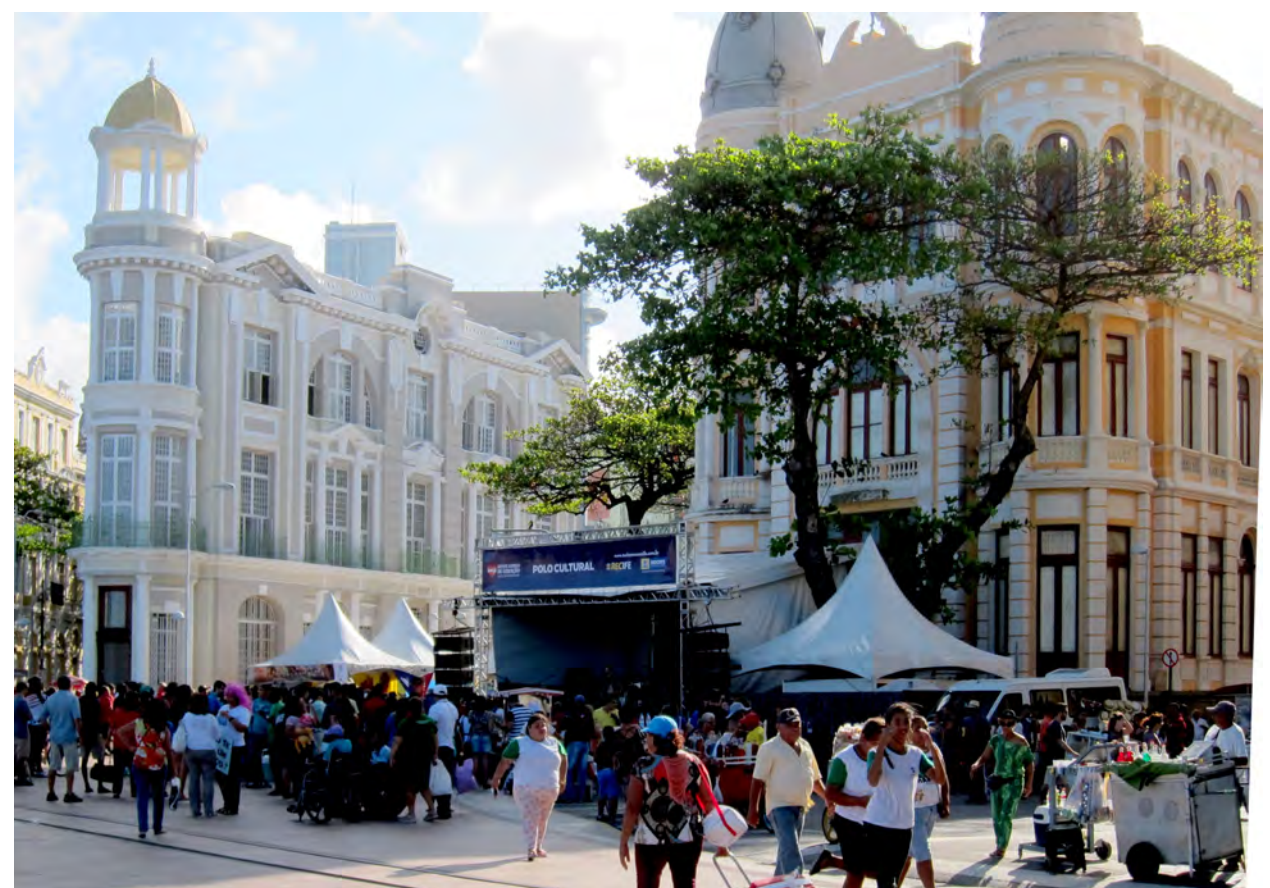
Figure 13. Historical center of Recife, Brazil. Historic preservation is an international activity, with international options. Names used internationally include heritage conservation, conservación del patrimonio (Spanish), and 遺產保護 (Chinese), among many other possibilities.

The last thought I will leave you with is to impress how important it is for new people, who have not traditionally considered this career path, to enter the field. We are challenged on multiple fronts by static regulations, climate change, and a serious need to address issues of inclusion, diversity, and social justice. To address these challenges, we need new perspectives, ideas, and methods that can more fully recognize, celebrate, and capitalize on the multiple heritages that represent our amazingly diverse country. Most people won't get rich working as an historic preservationist, but where else can you work in a field that fundamentally impacts people's identity, wellbeing, and sense of place.