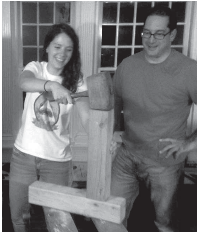
HISP 655 students making traditional joints using hand tools as part of a woodworking exercise.