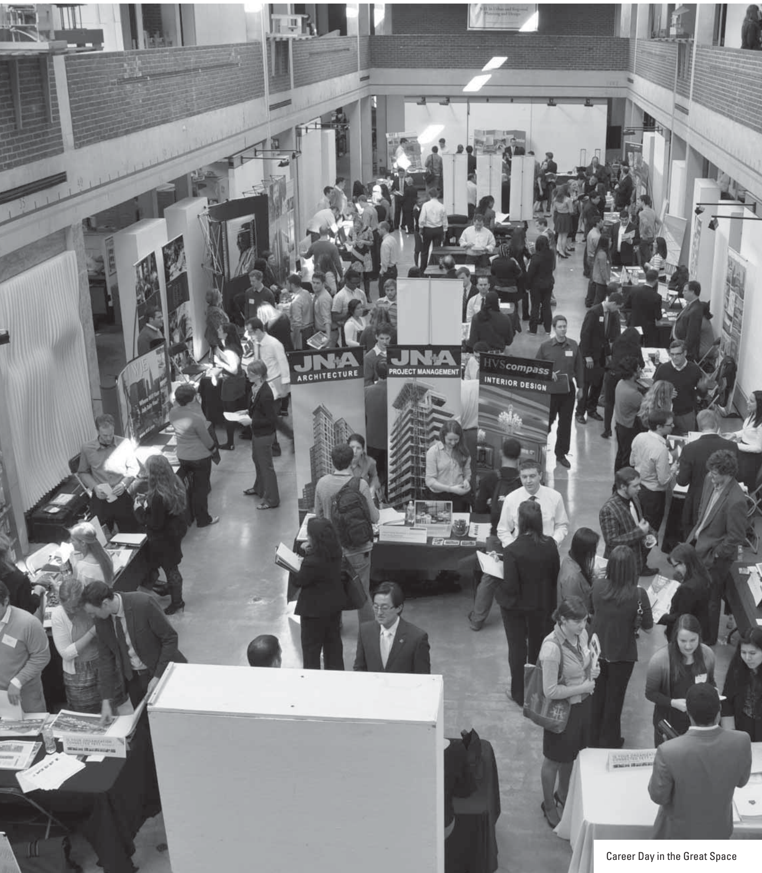
Career Day in the Great Space