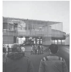
Entry plaza looking at main entrance to the proposed new baseball stadium. To the right of the image is Fieldhouse Drive in back of the STAMP Student Union. The image is by Robert Grooms a graduate student in Architecture and Real Estate Development.