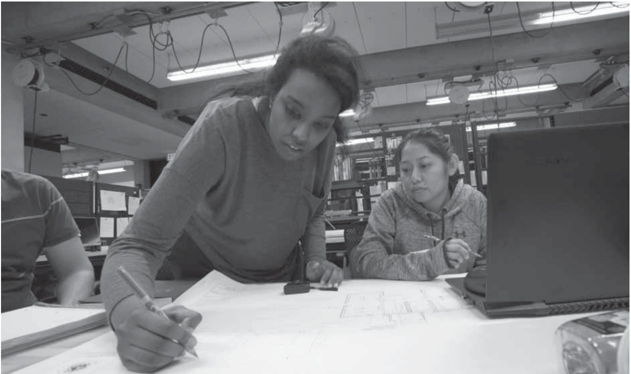
ABOVE: Students working on the Solar Decathlon project in studio.