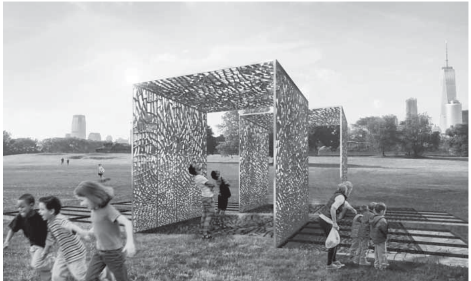
RIGHT: Rendering of prototype for Lisa Ramsburg's project "Cast & Place"